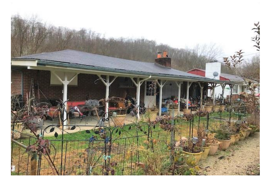
The façade is not visible in the left photograph due to distance, tree coverage and automobiles. Thus, taking the photograph from another angle (right photograph) was necessary.